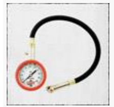
(Air pressure gauge)

A: Tyre pressure information can be found in the car manual. You can check the tyre pressure by using a tyre pressure gauge.