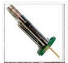
(A tread depth gauge)

A: The tread depth can be measured using a tread depth gauge. The legal minimum amount of tread should be no less than 1.6mm of tread in the central \frac{3}{4} of the tyre and there shouldn't be any cuts or bulges on the edge of the tyre.